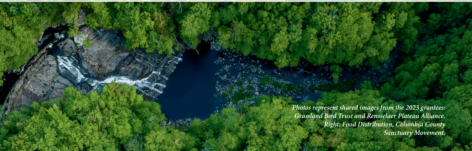
Photos represent shared images from the 2023 grantees: Grassland Bird Trust and Rensselaer Plateau Alliance. Right: Food Distribution, Columbia County Sanctuary Movement.