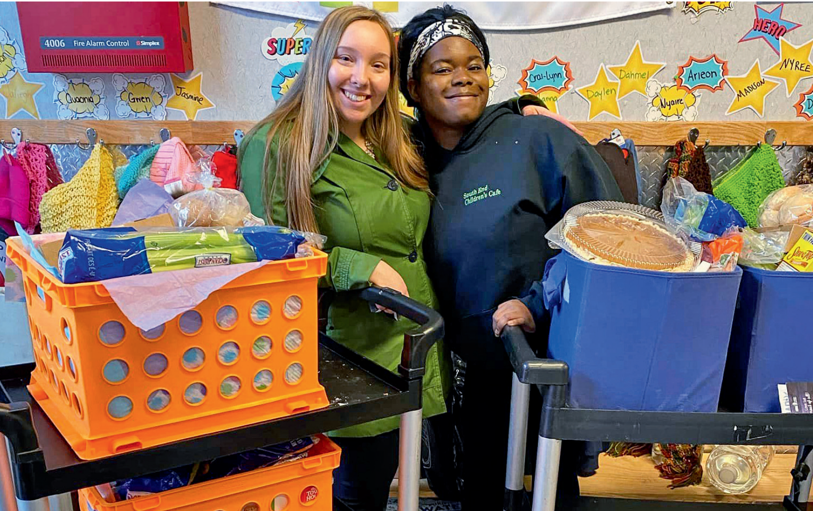
Below: South End Children's Cafe volunteers at work. Right: Preparing the trail at the Rensselaer Plateau Alliance.

From simplifying our grant application process to providing general operating support whenever possible, the Community Foundation works to move our region toward equity and fairness.