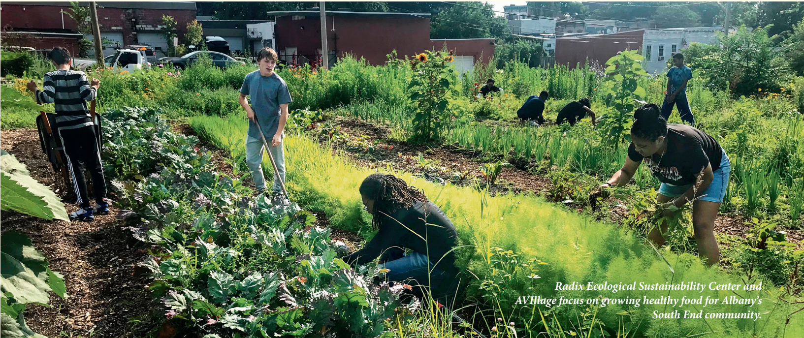
Radix Ecological Sustainability Center and AVillage focus on growing healthy food for Albany's South End community.

Understanding the risk factors and the social determinants are crucial in addressing chronic kidney disease and promoting healthier choices within communities. The Rubin Community Health Fund uses local data trends to identify the challenges facing our region to support programs that promote healthy living, access to healthcare, and preventative initiatives to create a healthier future for our neighbors.